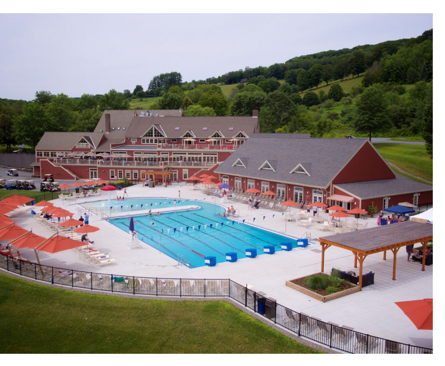
Amenities run the gamut from two championship courses to a family-friendly ski hill with two black diamond runs; a natatorium with lap lanes; the Lake Pinneo beach house with a sandy beach; and a racquet pavilion offering pickleball, squash, and platform tennis. All told, there are 15 miles of maintained paths ideal for hiking, mountain biking, and cross-country skiing.

A true four seasons playground in the heart of the Northeast.