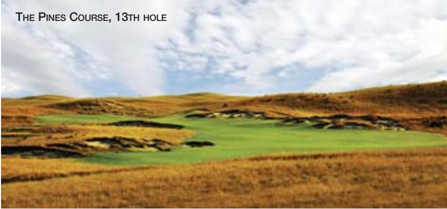
THE PINES COURSE, 13TH HOLE

UNDISTURBED HOLES OF GOLF Like the great links courses of the world that never forgot their sheep pasture upbringing, The Prairie Club was created to leave well enough alone. “These sandhills were created by a glacier that receded about 20,000 years ago,” explained Swedberg, “We’re fortunate that these courses were created, for the most part, well before the bulldozer.