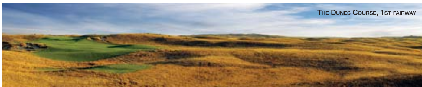
THE DUNES COURSE, 1ST FAIRWAY