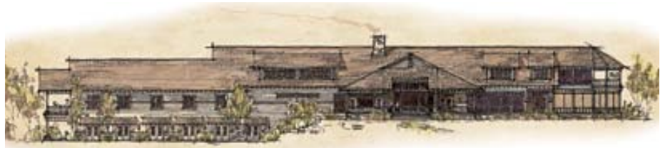
A RENDERING OF THE COMFORTABLY APPOINTED PRAIRIE CLUB LODGE THAT SITS ON THE RIM OF THE SNAKE RIVER CANYON.