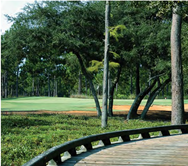
THE RESERVE GOLF CLUB at Pawleys Island, South Carolina: A private sanctuary, 20 miles south of Myrtle Beach, offers a Greg Norman course set in the pristine landscape of two of the wealthiest old plantations in the state. For more information: www.thereservegolf.com .