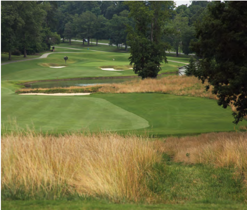
SEDGEFIELD COUNTRY CLUB in Greensboro, North Carolina: Host of the annual PGA TOUR's Wyndham Championship, the club boasts a Donald Ross design, Tudor-style clubhouse, and modern fitness, swim, and tennis facilities. For more information: www.sedgefieldcc.org .