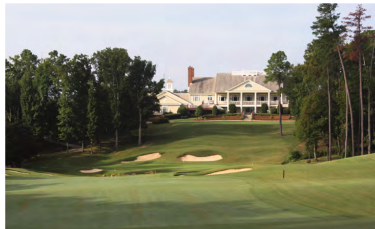
TPC WAKEFIELD PLANTATION in Raleigh, North Carolina: The latest addition to the McConnell Golf portfolio. The club features a Hale Irwin golf course, family friendly amenities, an expansive sports center, and a nine-hole, 2,700 yard, walking only, short course. For more information: www.tpcwakefieldplantation.com .