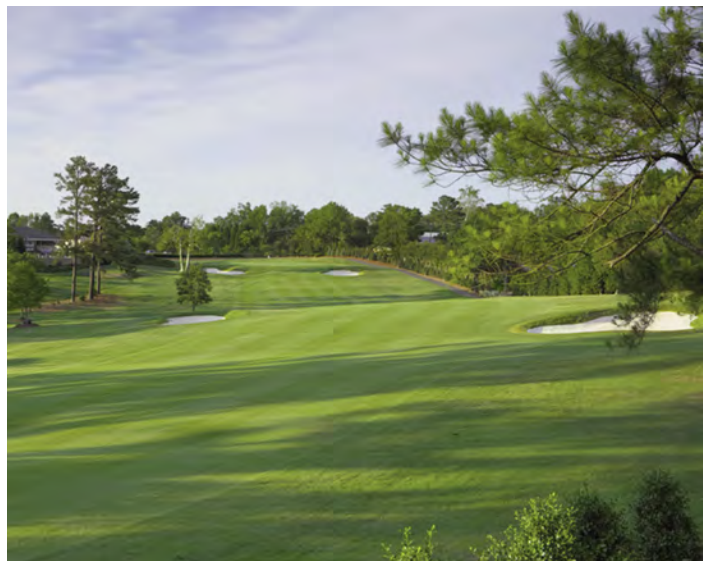
RALEIGH COUNTRY CLUB in Raleigh, North Carolina: Established in 1948, the club is located one mile from downtown Raleigh. The club features a modern pool complex and boasts the last course to be designed by the legendary Donald Ross. For more information: www.raleighcc.com .