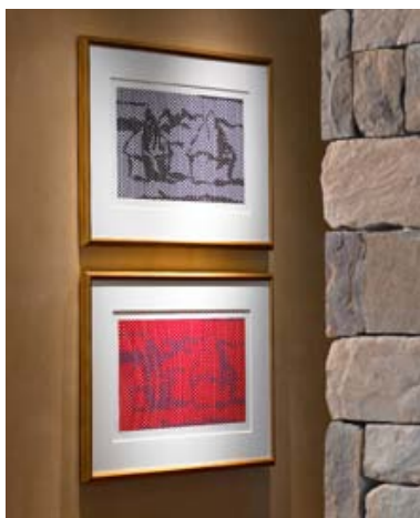
HAYSTACKS, BY ROY LICHTENSTEIN.