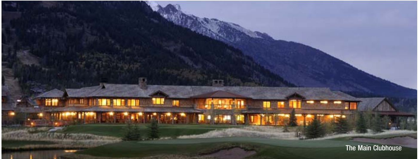
The Main Clubhouse